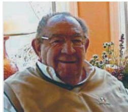
This is pretty good!