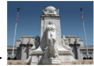
Monument in Washington D.C.

Oct. 11: 6:30 p.m., Regular Business Meeting and Annual Pizza Dinner. Auxiliary to make their specialty top secret recipe pizza's. Always a wonderful, fun, delicious, delightful time.